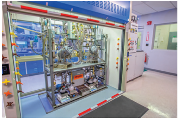
Figure 2. Aviation Lubricant Advanced Deposition Simulator (ALADS) rig

just another example of how Eastman Aviation Solutions continuously goes above and beyond specification testing and, ultimately, above what any other oil formulators can provide to the industry.