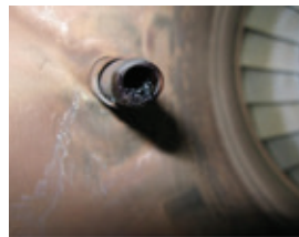
Competitor HPC oil