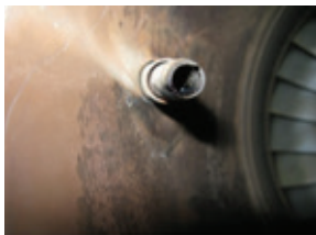
Eastman Turbo Oil 2197