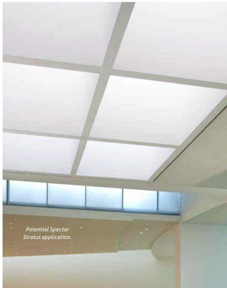
Potential Spectar Stratus application.