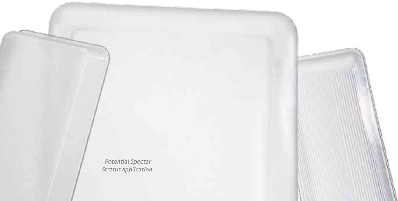
Potential Spectar Stratus application.