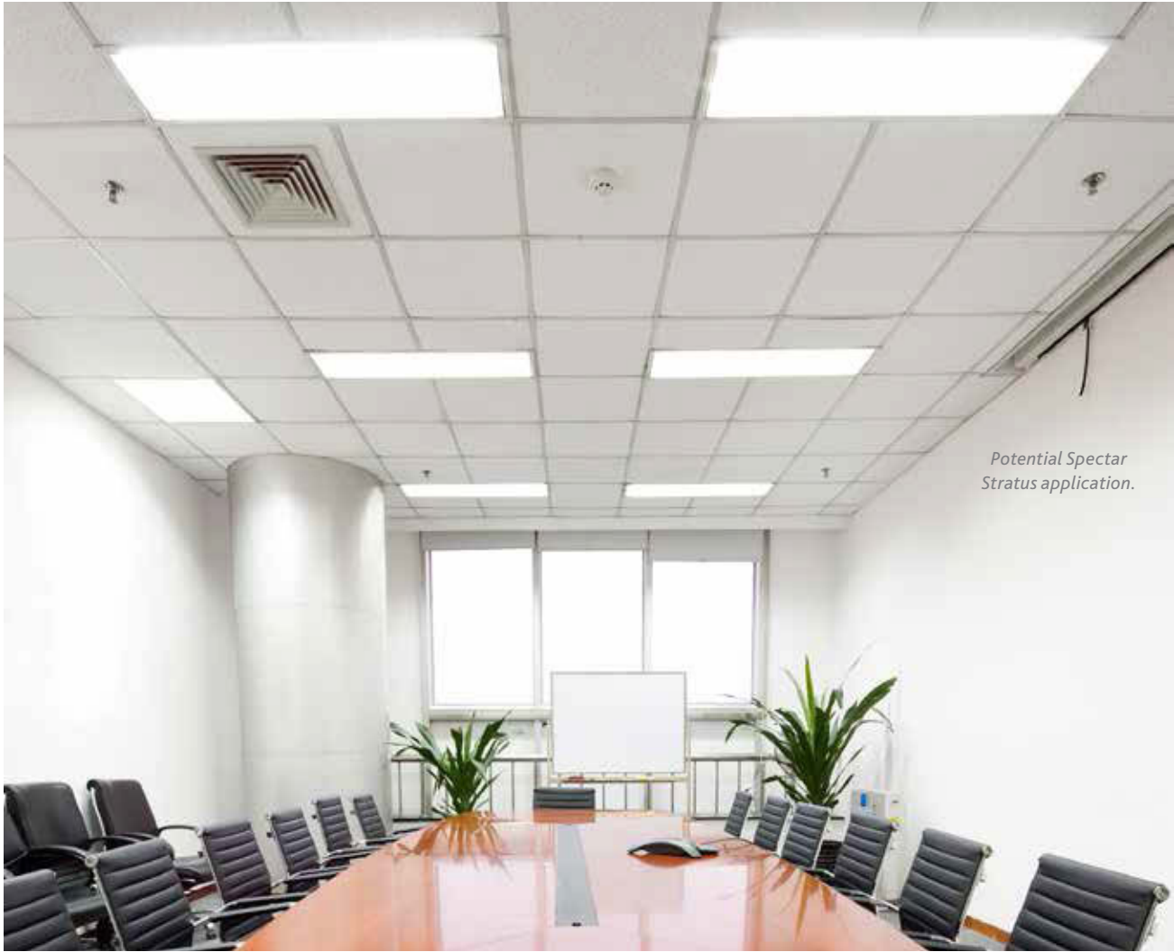
Potential Spectar Stratus application.